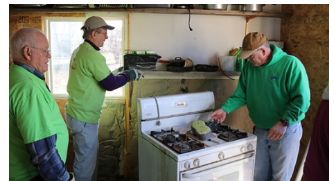
Members of the Great Plains Conference early response team clear flood damaged items from a home in North Loup, NE in 2019.

This includes natural and humanitarian disasters overseas. Some current examples are drought in East Africa, flooding in the Philippines; food and shelter for those fleeing battles in Ukraine – and now UMCOR is providing assistance with landmine detection there as many refugees return home.