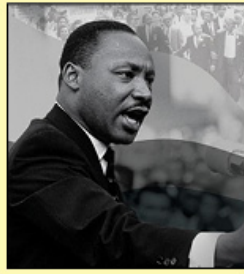
“The time is always right to do what is right.” - Martin Luther King Jr.

Monday, Jan. 15 th , 2024 Gordon Parks Museum 2108 S. Horton St. Fort Scott, KS